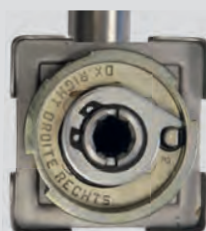
Handle power pack fixed/rotatable