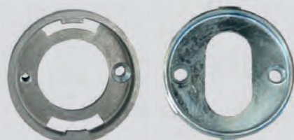
Stable metal substructure