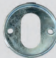
Stable metal substructure