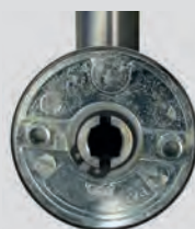
Handle set power firmly/rotating