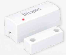
AUTO LOCKING MODULE