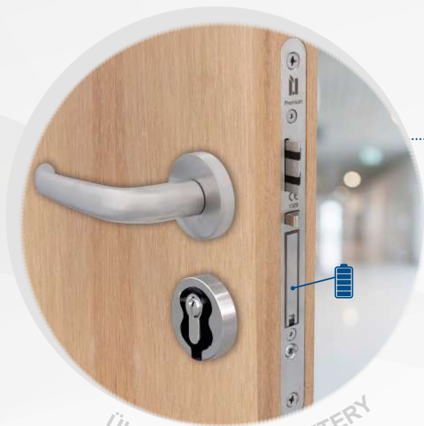
ÜLOCK NOVUS BATTERY