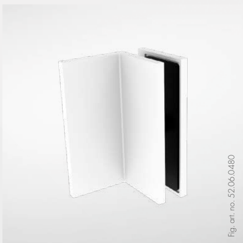
Fig. art. no. 52.06.0480

Bright chrome-plated / black matt / white matt