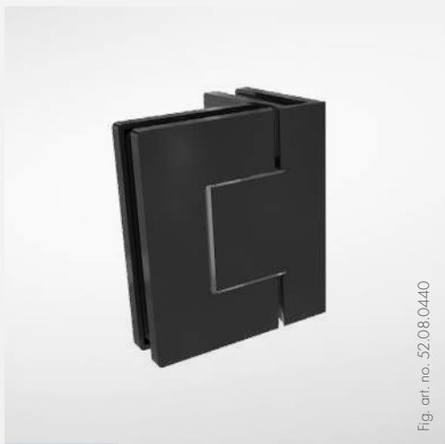
Fig. art. no. 52.08.0440

Bright chrome-plated / black matt / white matt