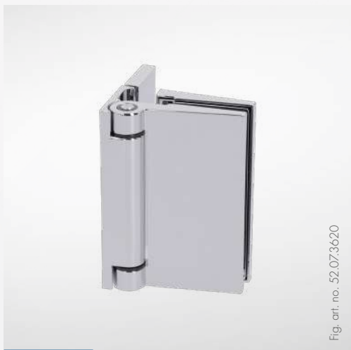
Fig. art. no. 52.07.3620