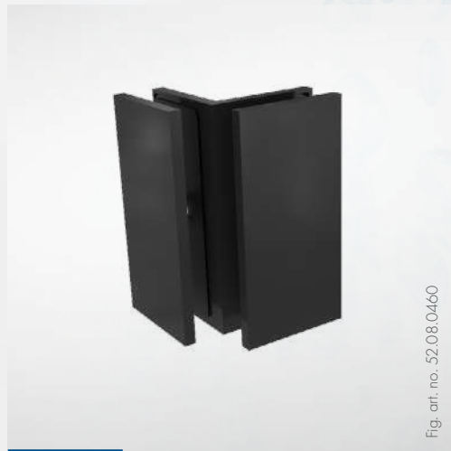
Fig. art. no. 52.08.0460

Bright chrome-plated / black matt / white matt