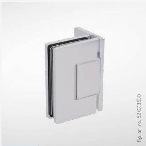
Fig. art. no. 52.07.3530