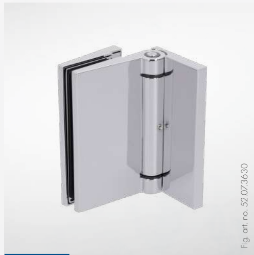
Fig. art. no. 52.07.3630