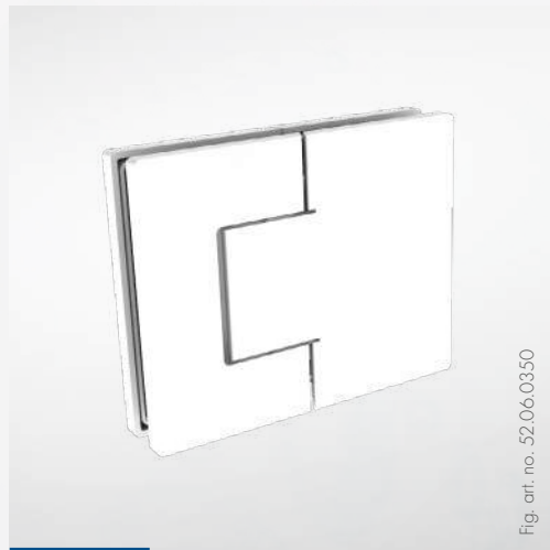
Fig. art. no. 52.06.0350

Bright chrome-plated / black matt / white matt