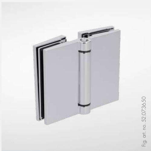
Fig. art. no. 52.07.3650