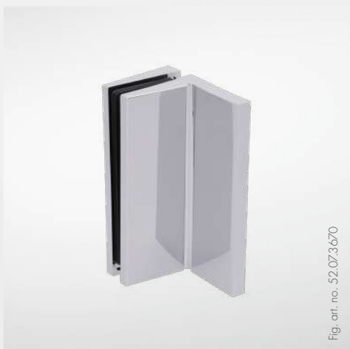
Fig. art. no. 52.07.3670