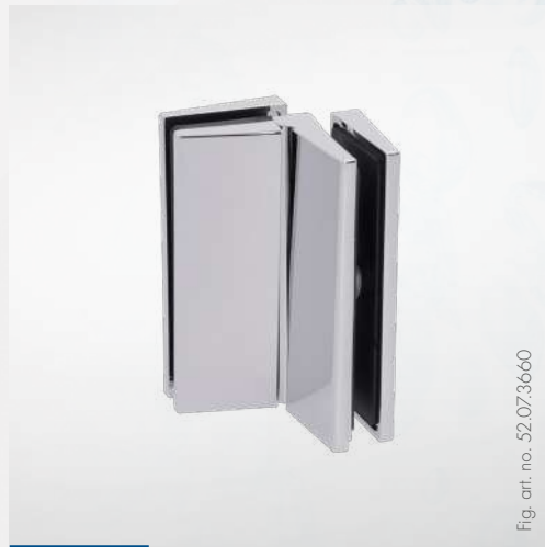
Fig. art. no. 52.07.3660